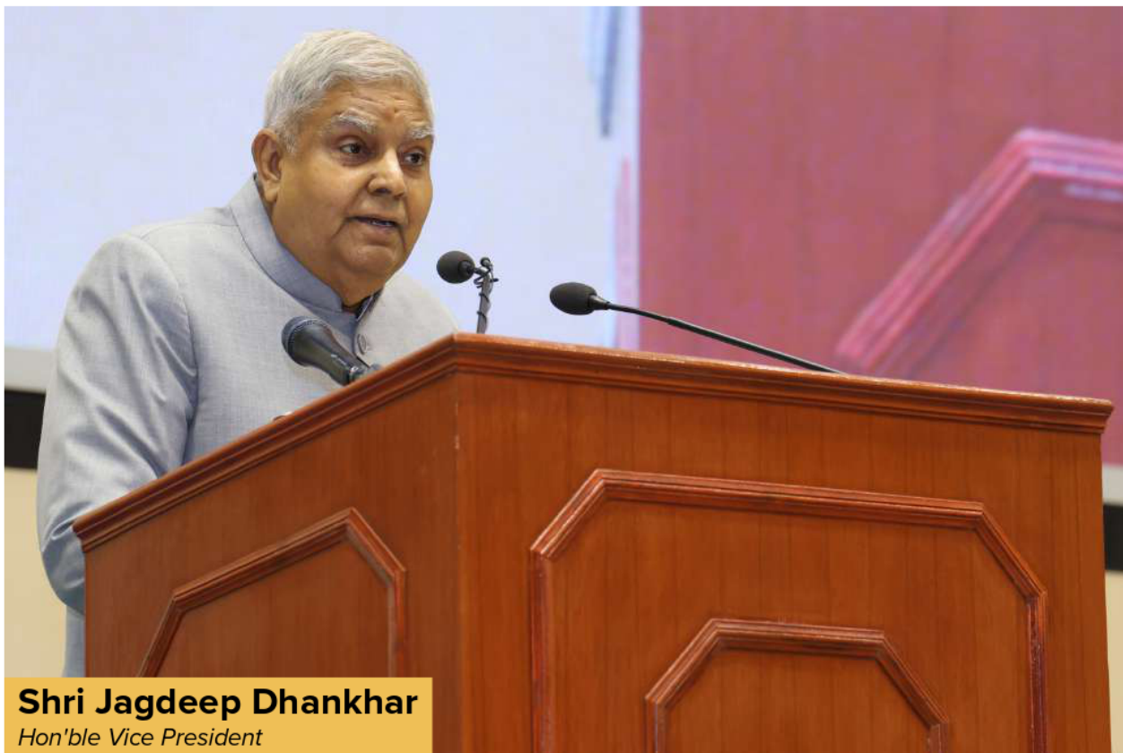
Shri Jagdeep Dhankhar