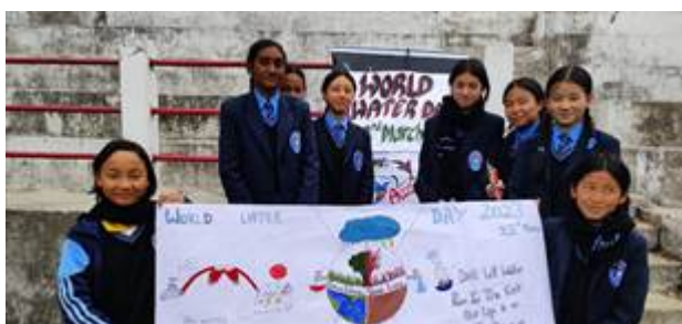
ECO Clubs at schools teaching their peers, school staff, parents & the community about environmental issues through club activities