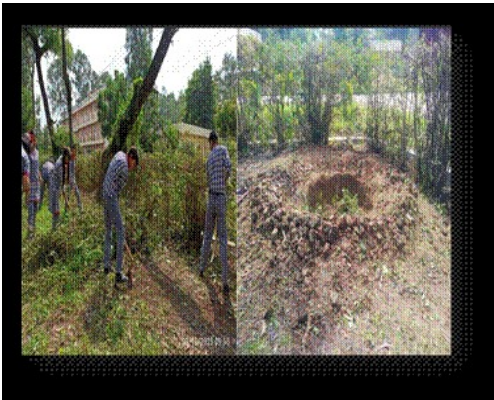
Students engaged in making compost pits at schools