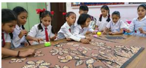
National Bal Bhavan engaged in teaching students to create art and craft from waste and discarded material